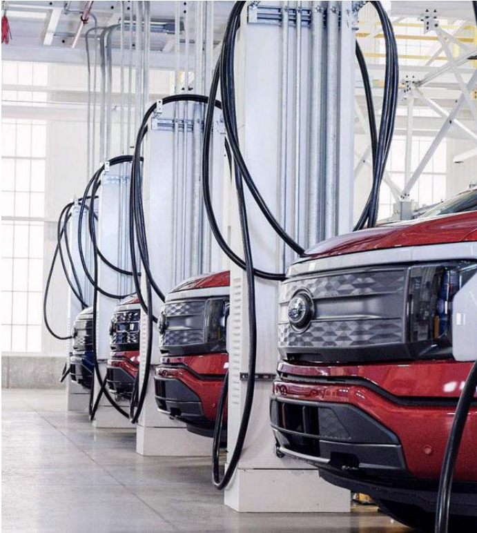
Ford F-150 Lightning.